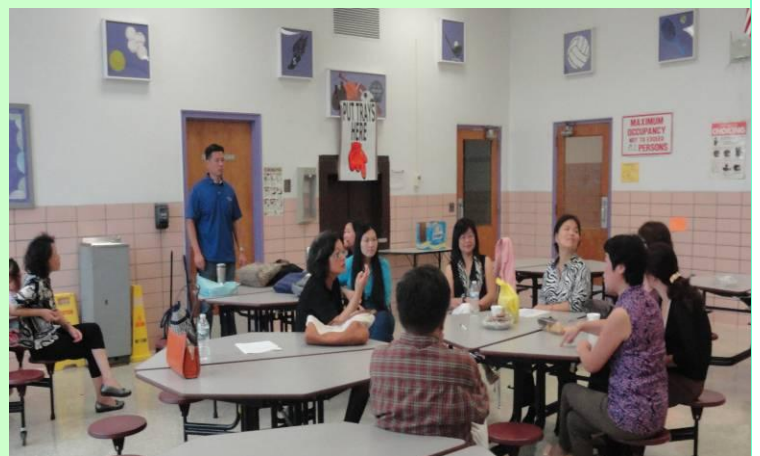
Teacher's meeting-September 21, 2013, (Cont'd to P5)